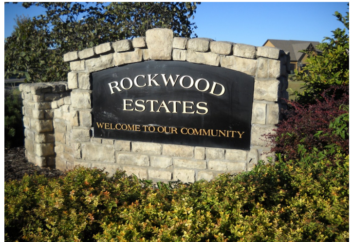
The newly re-created Rockwood entry sign

The Rockwood Homeowners Association has created this new newsletter to get the word out on happenings regarding your neighborhood. There has been a lot going on this year to include a portion of unneeded walking path removed and a swale installed and Blue Sky Development's leaving the neighborhood. We hope this newsletter serves to inform and invite you to participate in your homes association.